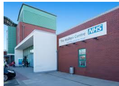
The Walton Centre