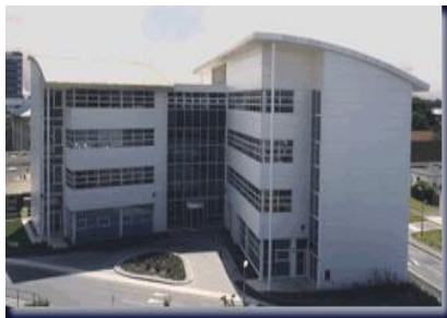
Clinical Science Centre